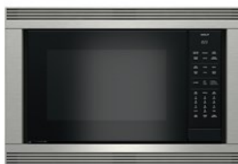
E SERIES STAINLESS